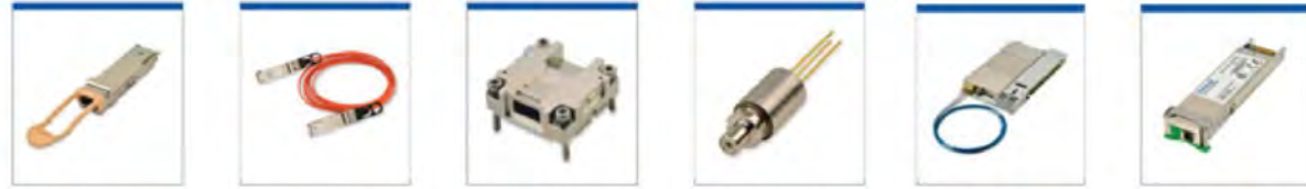
Optical Transceivers Active Optical Cables Optical Engines Communication Components Wavelength Management, ROADMs, WSS & Amplifiers RF-over-Fiber